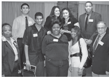
Trenton Central High School