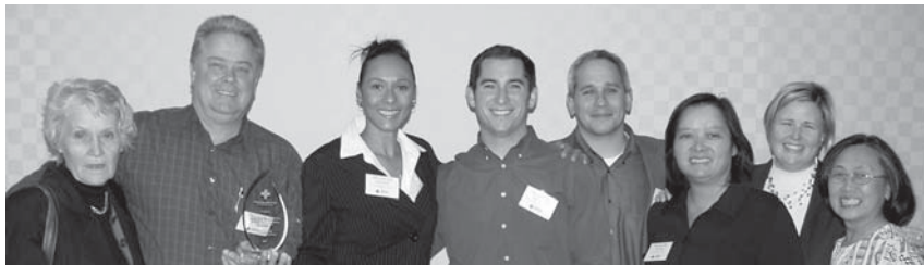
Johnson & Johnson

Outstanding Corporate Sponsor Award Titusville Campus of Johnson & Johnson Family of Companies