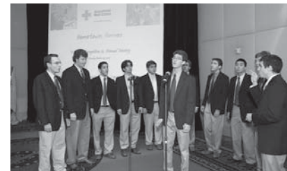
The Princeton Nassoons, Princeton University's a cappella singers, donated their talent for the evening

Awards were presented during the Hometown Heroes Volunteer Recognition and Annual Meeting held 10/25/07. (See inside for additional details.)