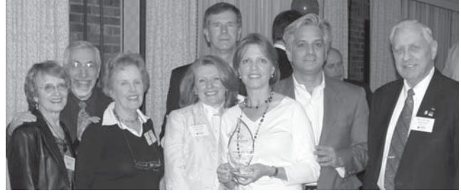
St. James Church of Pennington